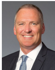
Richard Blaiklock Lewis Wagner, LLP