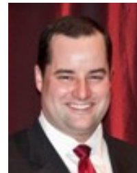
Tom McCord Tom Wood Aviation