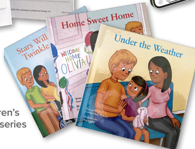
Children's book series