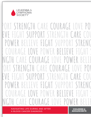
The Pediatric Survivorship Workbook

The Leukemia & Lymphoma Society (LLS) has created a comprehensive set of materials for parents and guardians of pediatric patients.