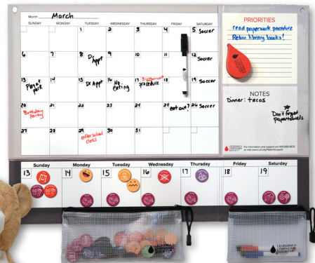
Dry-erase magnetic calendar