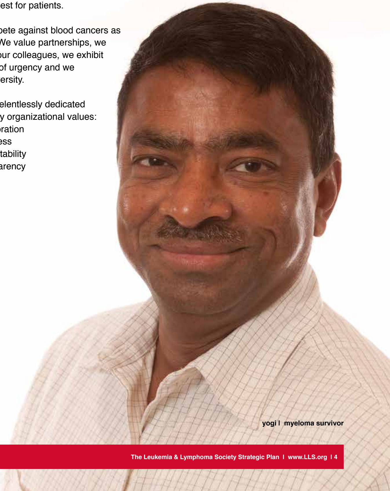
yogi | myeloma survivor