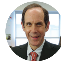
Brian Druker, MD, The Knight Cancer Institute at Oregon Health & Science University